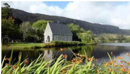
Gougane Barra, County Cork

St. Finbarr (550 – 620) came to Gougane Barra and lived there as a hermit (a person who lives alone and apart from others and devote their time to prayer). When disciples (followers) gathered round him, he moved to Cork at the mouth of the River Lee where he founded a monastery, which became a famous centre of learning.