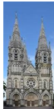
St. Finbarr’s Cathedral