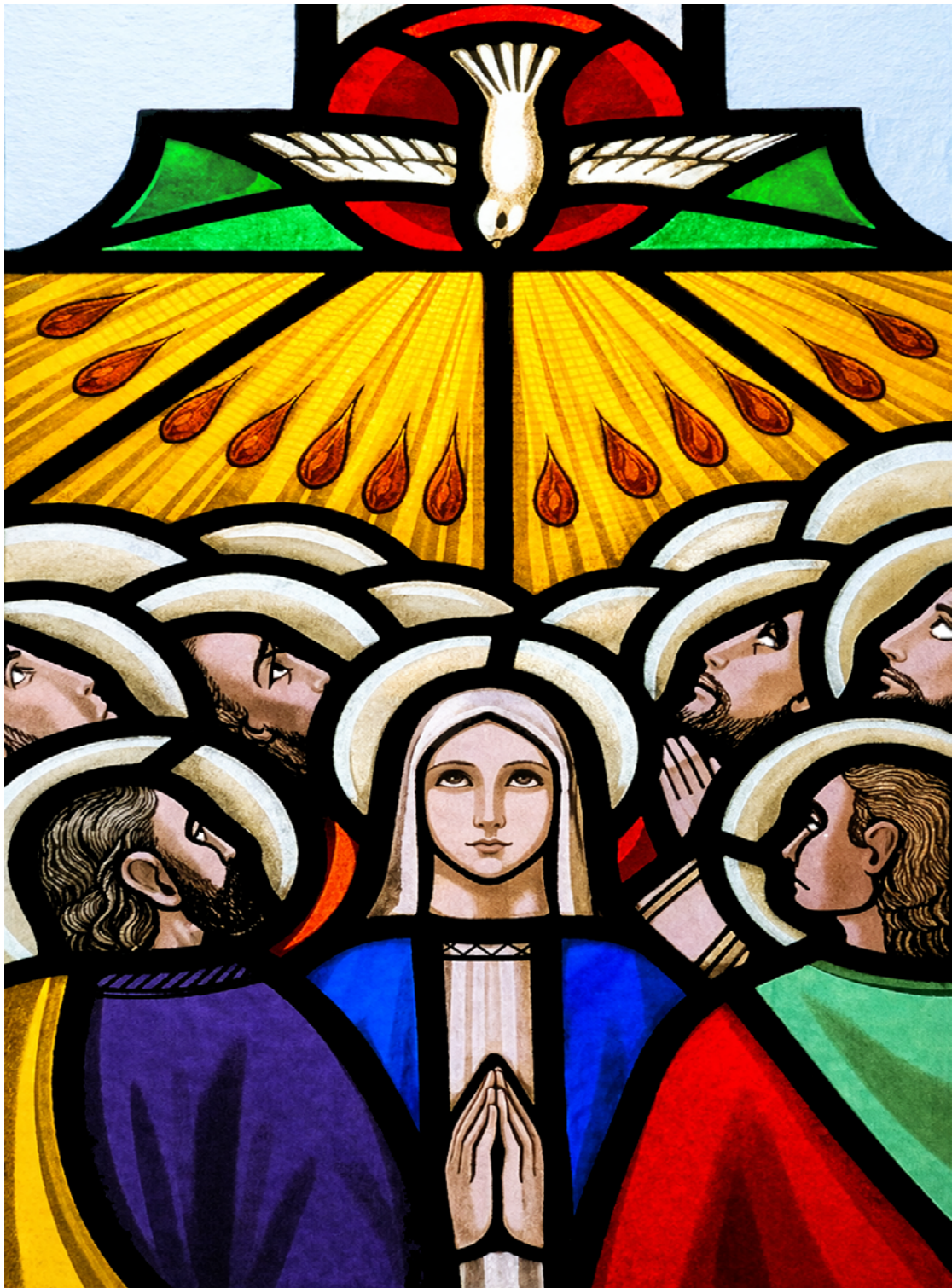
Pentecost, from St John's Church, Carraroe, Sligo